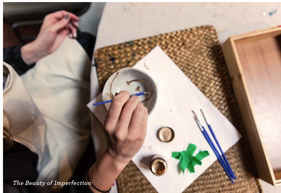
The Beauty of Imperfection

NEW HABITS FOR A NEW YOU Habits can potentially lead us to healthy harmony or keep us trapped in unconscious patterns. Everyone can boost their resilience and mental wellness with better practices. Through discussion, guided meditation, and intuition, this workshop steers away from unhelpful habits toward healthy behaviors that align with a renewed vision. $