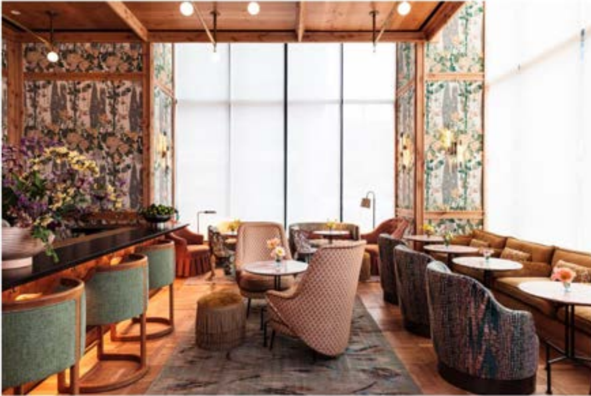
Goldie's at the Austin Proper

Read on for Galerie's list of where to stay, eat, and visit.