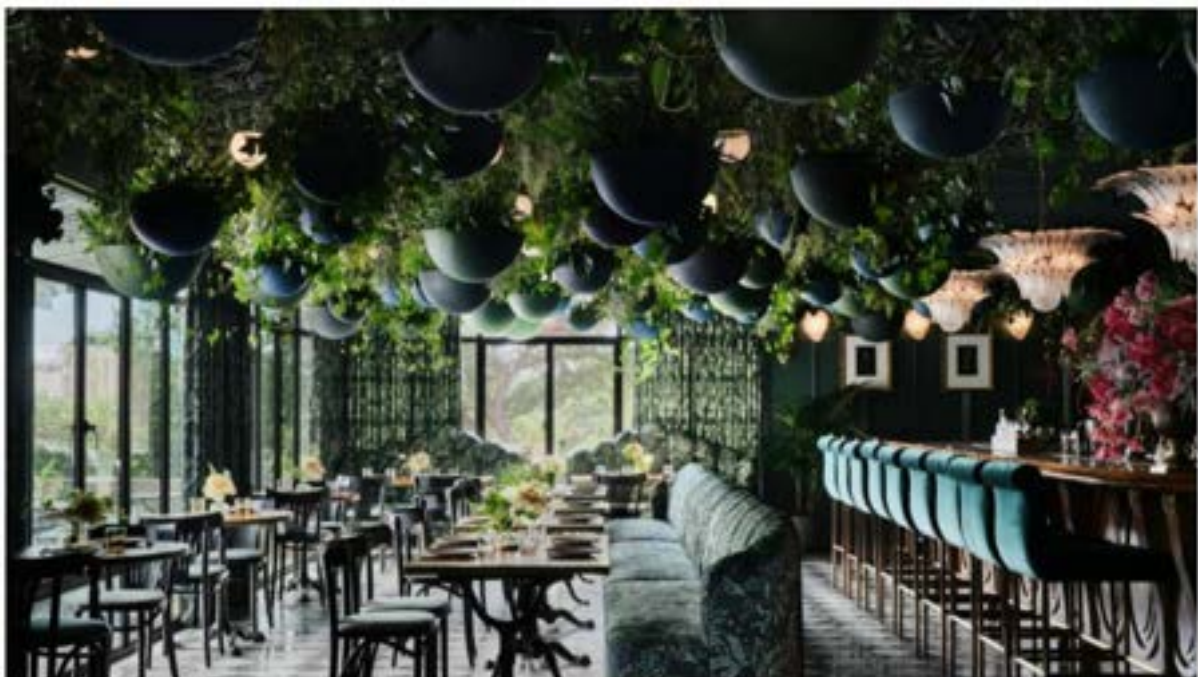
Luby's Garden Restaurant designed by Wes Fulk.

Popular Arizona wellness brand Miraval expanded to Austin in 2019, opening a 220-acre retreat overlooking Lake Travis, one of the city's leading attractions. Featuring 117 guest rooms and suites crafted by Hart Howerton, the sprawling Hill Country property also is home to a 20,000-square-foot Clodagh-designed spa, an organic farm that offers cooking classes, and an infinity pool. Even a brief stay will no doubt leave you feeling completely rejuvenated.