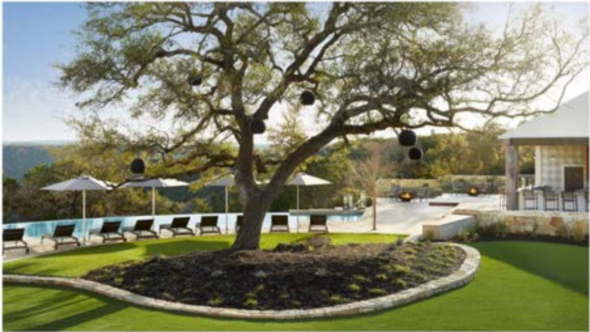
Miraval Austin Resort & Spa.