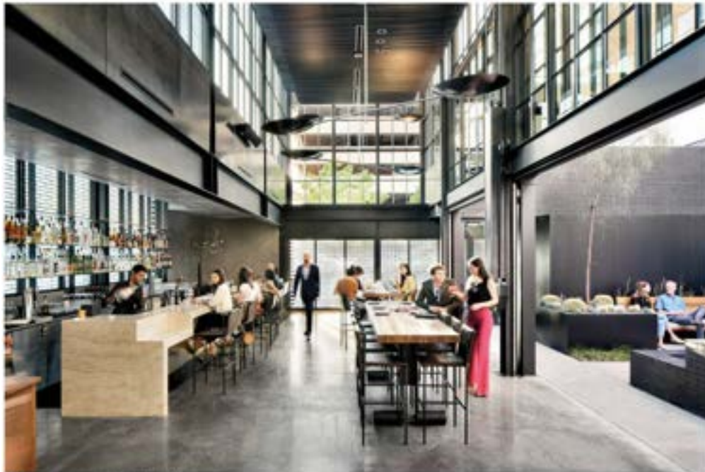
Commodore's interior mixes glass, brick, wood, and steel.