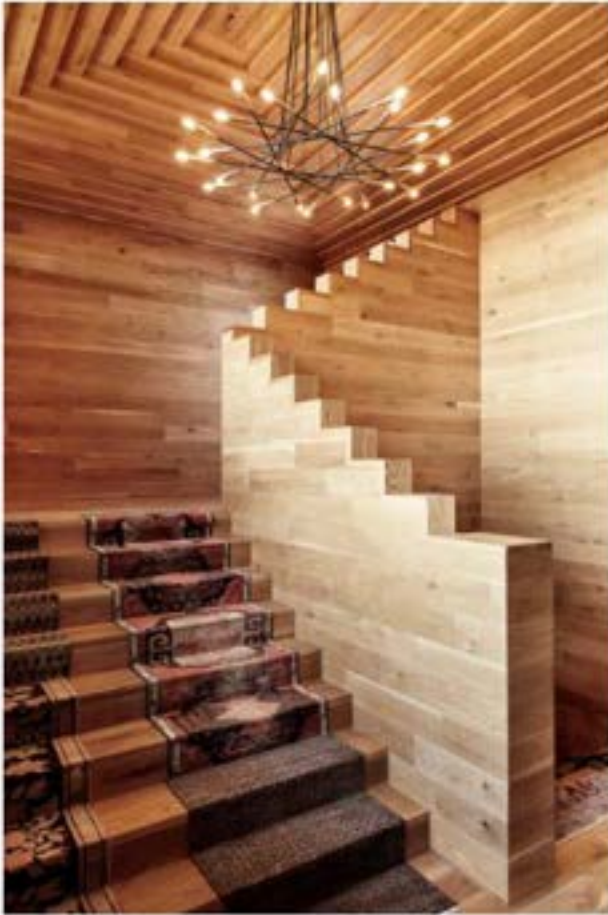
The entry staircase at the Austin Proper hotel.